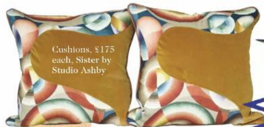
Cushions, £175 each, Sister by Studio Ashby