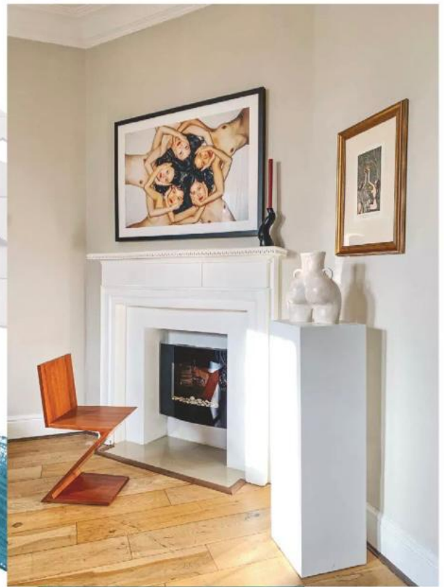
Poolhouse paint, from $40. Left: Adulterating paint from $40. Both Coat

"Applying a new colour to walls, ceilings or other surfaces is transformational. If you need inspiration for the perfect hue, use existing artworks or furniture to guide your palette, or just look out of the window." Kelly Wearstler, interior designer