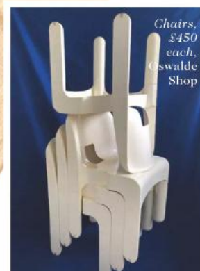
Chairs, $450 each, Oswalde Shop